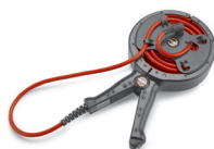
Inductive Signal Clamp